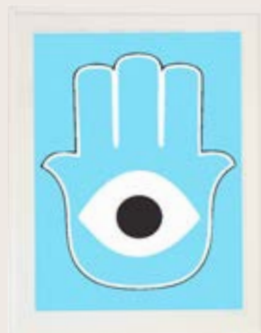
Martyrs Road Pigment printing on fine art paper 100 x 70 cm, 2018 Edition 1/1