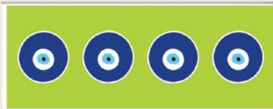
Erez Crossing Pigment printing on fine art paper 130 x 50 cm, 2018 Edition 1/1