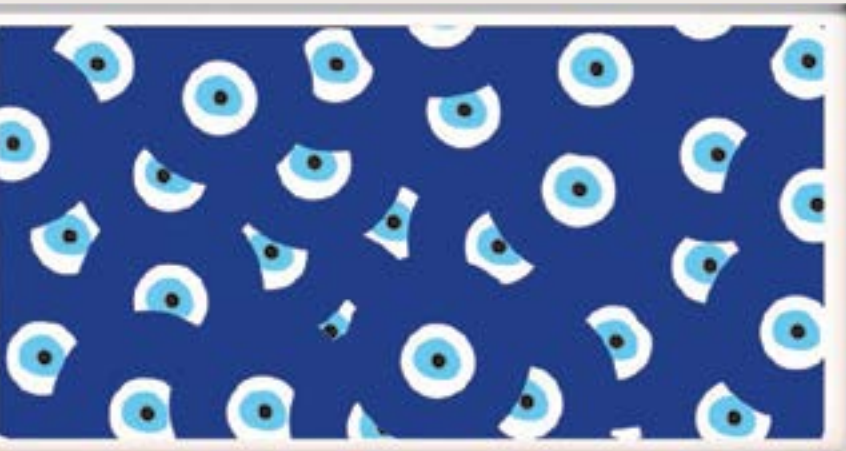
Al Wad Street Pigment printing on fine art paper 120 x 60 cm, 2018 Edition 1/1

a sign that tells people: "Stop, there is a checkpoint that will push YOU away." The eye ( al-ain ), which is supposed to watch out for and guard against malevolent people, has turned into a sort of "camera" that stares at YOU, making you a suspect. Amulets... how many do we need to protect ourselves from the harm of the occupation?!