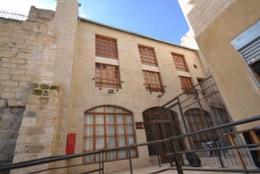
Dar Al-Shomali Guest House.

trends in a contemporary manner to protect and develop the urban fabric and traditional buildings. On the other hand, the rehabilitation projects not only preserved the local built cultural heritage, they also utilized it as a tool for socio-economic development through adapting traditional buildings for the benefit of the community.