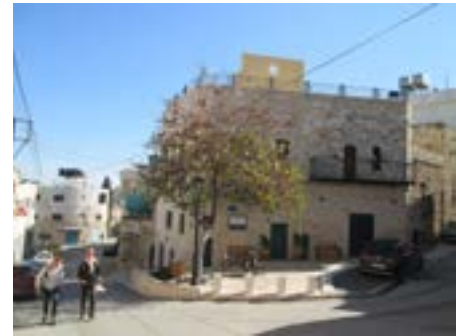
Dar Awwad used by the Peace by Piece tourism information center.

Taking a short stroll south of the square, one discovers Dar Sababa and Dar Ishaq. These two buildings share an internal courtyard and now serve as the Bethlehem Fair Trade Artisans (the Handcraft Village), a center that specializes in promoting