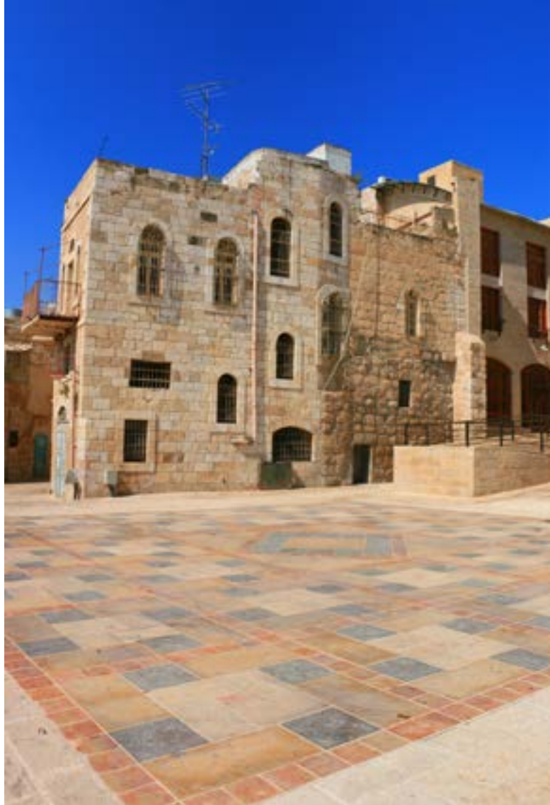
Old Market of Beit Sahour, revitalized for community activities and festivals.

Once-abandoned buildings and neglected areas have been significantly transformed, creating a vibrant environment in the city and providing vital services to the town of Beit Sahour and its surroundings.