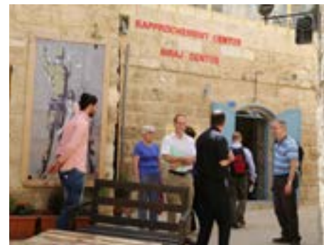
Dar Hilal Building used after rehabilitation for the Palestinian Centre for Rapprochement between People.

The revitalization of the historic center of Beit Sahour has had an impact on various aspects of the city. On one hand, the end result of implementing the aforementioned projects in a relatively small area contributed to re-energizing the cultural, social, religious, economic, and tourism sectors through adopting traditional